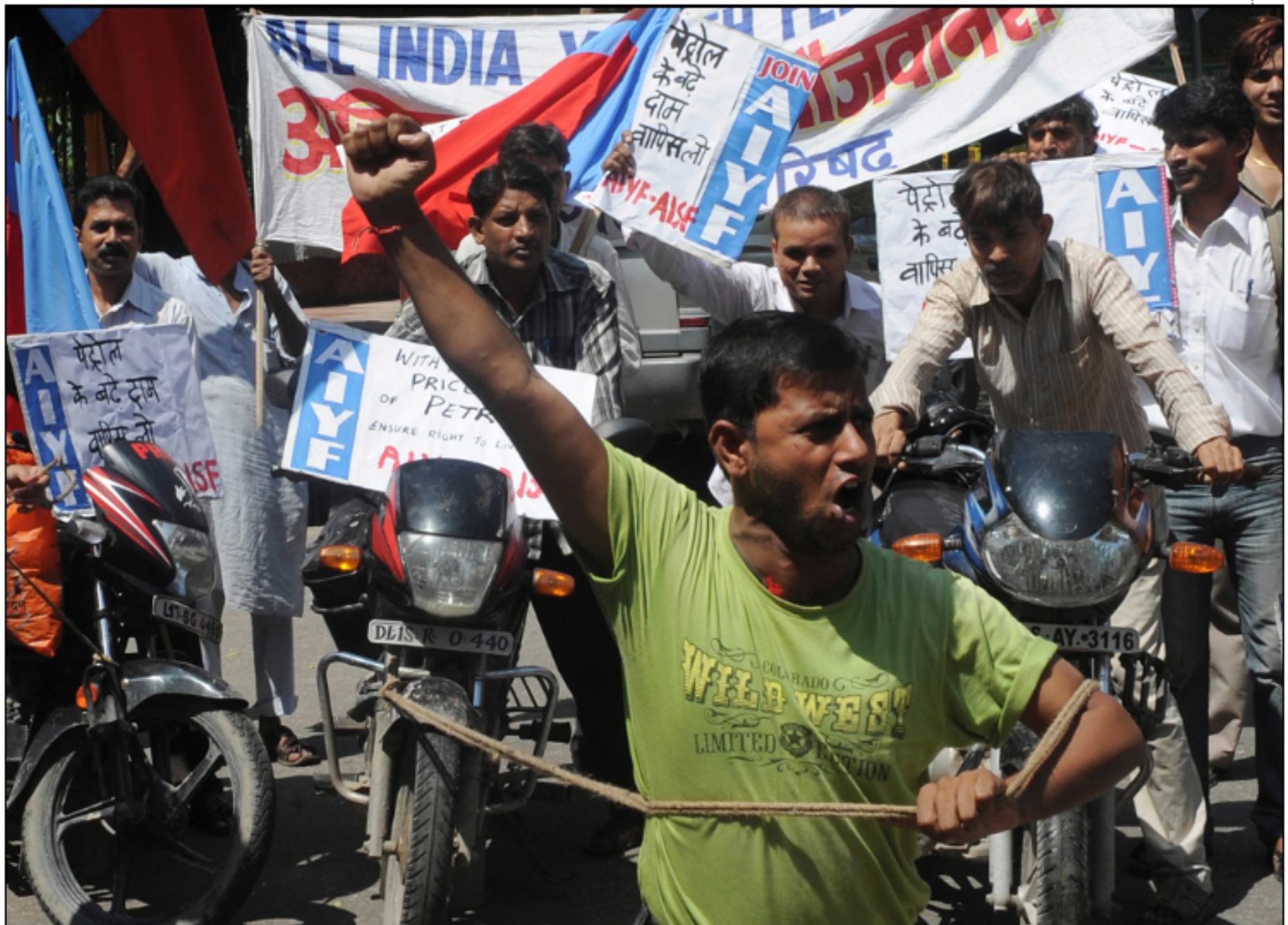
30 An activist from the "All India Youth Federation" pulls motorcycles as several shout anti-government slogans during a protest against petrol price hikes in New Delhi, Sept. 16, 2011. India's central bank raised interest rates by a quarter of a percentage point in its 12th hike since March last year to combat near double-digit inflation. State-owned energy firms hiked petrol prices by five percent to stem losses from high crude prices, leading to condemnation from opposition parties which called the move "inflationary." (Raveendran/AFP/Getty Images) #